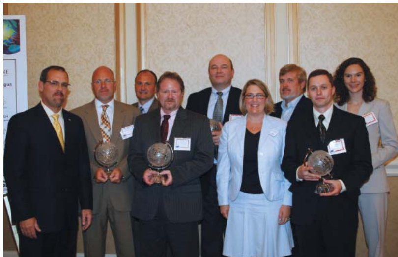
The VALET program's newest graduates proudly display their globes.

The AIM program honored nine graduates: Amthor International, Timber Truss Housing Systems, both of Salem; Ceramic Technology Inc. of Cedar Bluff; Charlotte America of Bluefield; Collier Research/Hypersizer of Newport News; Consolidated Steel of Pounding Mill; Gatekeeper Security of Reston; Joan Gabriel Company of Fredericksburg; and Sealeze of Richmond.