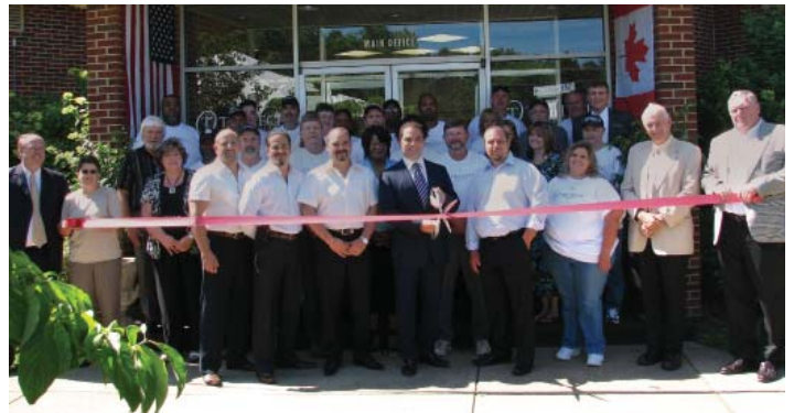
Trutech cut the ribbon on its first North American facility July 8 in Spotsylvania County.