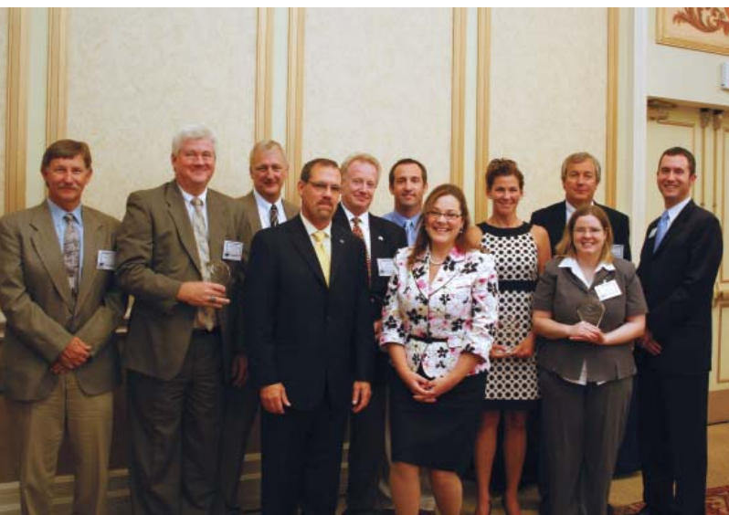
Staff from VEDP International Trade pose with the new AIM program graduates.

During their year in AIM the graduates made a combined 17 trips to their AIM target countries and, as a result, three reported signing new representatives. These graduates used AIM funds for projects to support their export strategy, including updating international legal agreements, achieving global IPR registrations, sending demo products to in-country partners, making SEO and Web updates, updating marketing materials, participating in trade shows, and completing global advertising campaigns and various translation projects.