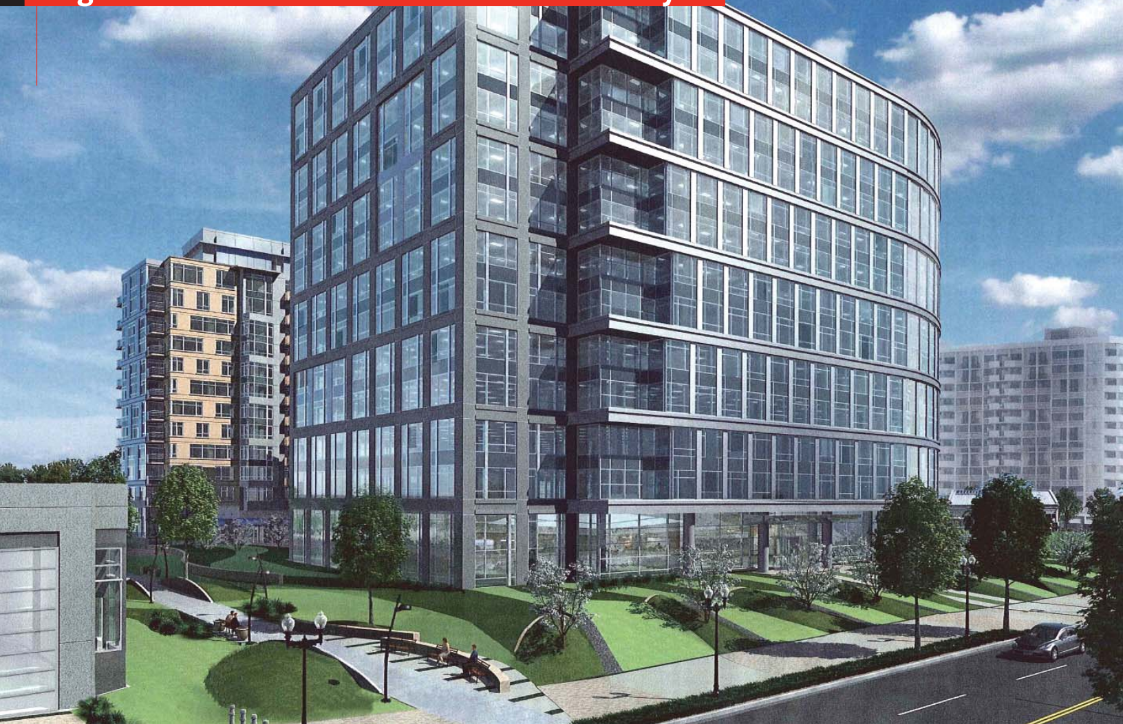
Groundbreaking for the new DARPA facility, shown in this rendering, is scheduled for early 2010.